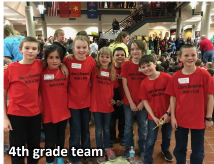
4th grade team

Check out some of their successes so far. ➡