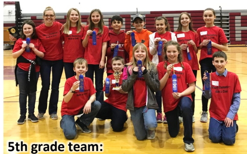
5th grade team: 1st in division at Math Classic 4th overall at Math is Cool